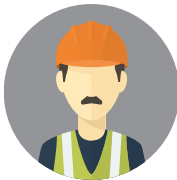
Maintenance Workers in the Cone Zone