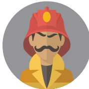
Firefighters & EMTs